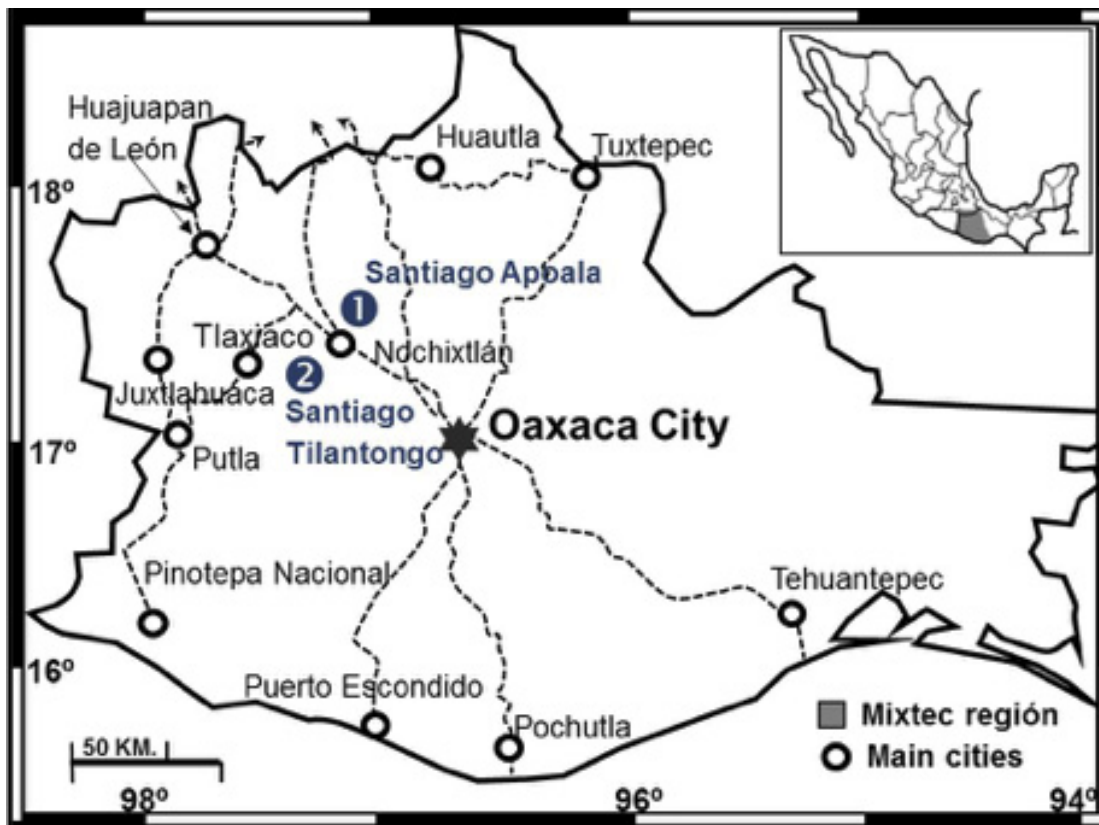
Figure 1. Geographical location of Santiago Apoala ( marked inside a circle as 1) and Santiago Tilantongo (marked inside a circle as 2) places of manufacture of the Yuta Tnoho or Vindobonensis Mexicanus I Codex and distribution of the Mixtec group in Oaxaca, Mexico (located in the map in the upper right corner).

appears the deity 4-Lizard transformed into the sacred mushrooms to be consumed, following which 9-Wind is shown elaborately dressed and carrying on its back 4-Lizard, with three transparent mushrooms on its head. These deities go to a place where there is the precursor of corn, the god Tlaloc and the valley of the ancient dead (Figure 2). Below that is one of the most beautiful scenes of the story, where the god 9-Wind sings accompanied by music produced by scraping a bone against a human skull. In front of him, with tears in his eyes and holding in his hand two mushrooms, is the god 7-Wind or Pilzintecuhtli, the prince of flowers represented by Xochipilli among the Mexica. The tears are probably a result of the trance. In the background are shown the two ñuhu who started the story accompanied on this occasion by a nocturnal insect (Figure 3) suggesting that the mushroom ceremony was carried out at night, just as it is currently performed in Mexican ethnic groups.