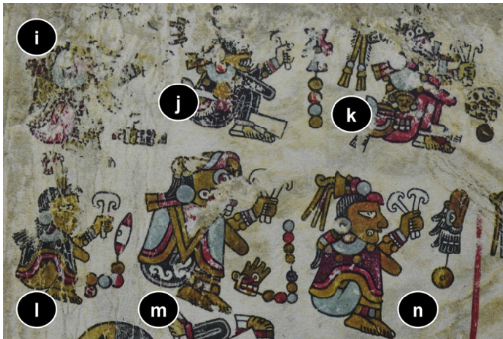
Figure 5. In the scene related to the “mushroom nocturnal meeting” the deities 1-Death (i), 4-Movement (j), a deity not clearly identified (k), 5-Flint (l), 9-Grass (m) and 1-Eagle (n) participate. All of them hold two transparent mushrooms, except 5-Flint and 4-Movement, which hold only one mushroom. The best preserved is the goddess 1-Eagle (n).

Subsequently, six deities appear, but now without mushrooms. In pre-Hispanic Mexico it was believed that mushrooms could be a path to spiritual growth or rebirth. Perhaps for that reason the deities now appear changed after consuming them; some of them appear larger, others with new clothes or with additional ornaments. The story continues with what seems from the calendrical signs to be a long wait. There are now three elements. The first is a pyramid that sings, a unique representation in its type in Mesoamerica. The second is the Apoala River but now with its waters beautifully red, yellow and blue; on the bank of the river two elements emerge – on the left the glyph of a mountain and on the right the glyph of an incipient sun. The third element is a corral of stones.