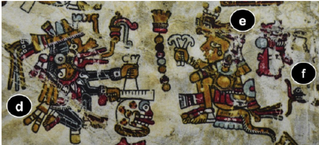
Figure 3. Beginning of the mushroom ceremony, where it is possible to appreciate the god 9-Wind, equivalent to Quetzalcoatl among the Aztecs, seated, singing and making music by scraping a bone on a human skull (d) in front of the god 7-Flower, also seated, holding in his right hand two transparent mushrooms while crying (e). At the back of the scene it is possible to see a red “ñuhu” and a black insect (f).

The story continues with the inclusion of the following elements: a mat, a throne, a cradle, a walled city, and barely perceptible to the right a singing deity, which have been interpreted as elements of a message as to how to create a good kingdom (Figure 4). Facing these elements are seven deities holding transparent mushrooms in their hands. The first one is a nameless deity painted black, which holds a pair of mushrooms. The following deities holding a pair of fungi are 1-Death, a deity not clearly identified; 9-Herb; and 1-Eagle (the lady of the rivers). In con-