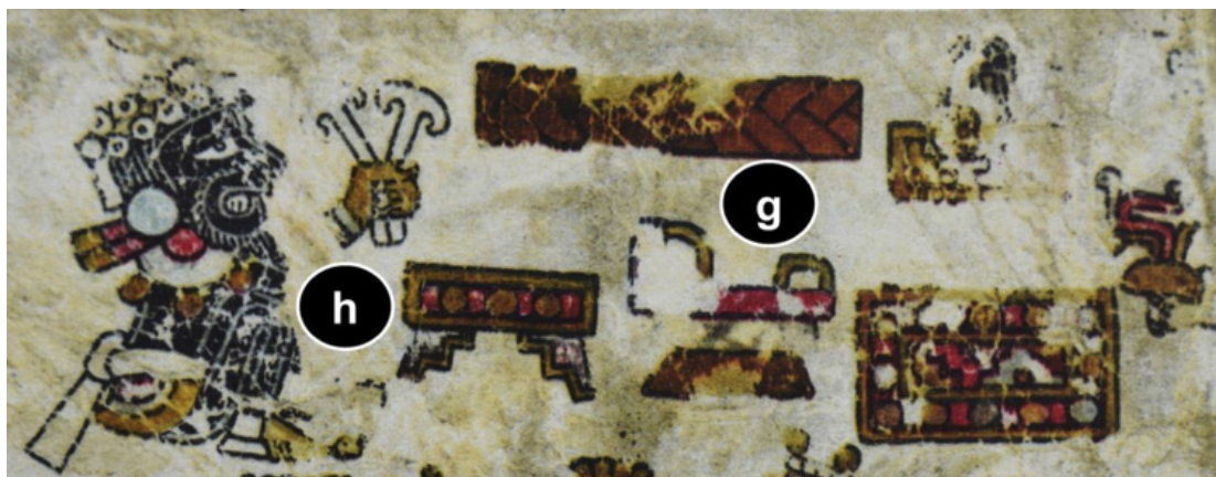
Figure 4. As a central part of the mushroom ceremony, it is possible to appreciate the participation of eight deities. Only one of them, which hold two transparent mushrooms, has no name and is painted in black (h); in front of this deity we can observe the elements that represent the new kingdom to be formed: a mat, a throne, a cradle and a walled city. At the end the symbol of a song is also appreciated (g).

trast, two of the deities, 5-Flint and 4-Movement, hold only one mushroom (Figure 5). This is the only pre-Hispanic representation of a mushroom ceremony, which has survived in Mesoamerica. Then, there is a character painted black that is thrown into a cave on the Apoala River or Yuta Tnoho, to later emerge as 7-Wind, holding in his hand yellowish-brown plants or sacred mushrooms. 7-Wind is now wearing an eagle mask and two faces, each looking to another side. In front of him is 7-Movement, beautifully adorned with a jaguar head.